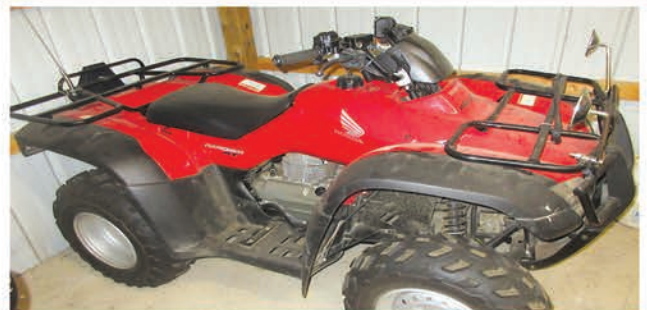
2007 HONDA RANCHER ATV 4X4 Electric Shift (like new)

Lanterns • Bible Table w/casters • Upholstered Desk Chair • Step Stool • Globe on Stand • Cast Iron Dutch Ovens • Kerosene Lamps • Wooden Nut Cracker • Wooden Semi Trucks • Milk Glass • Canes • Granite • One Man Cross Cut Saw • Other