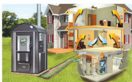
More comfort for your entire home

"It is so much more convenient than having to constantly load the indoor wood burner and I am using about half the wood. I am more at ease with the fire outside away from the house along with the dust, bugs and ash." – Lucas