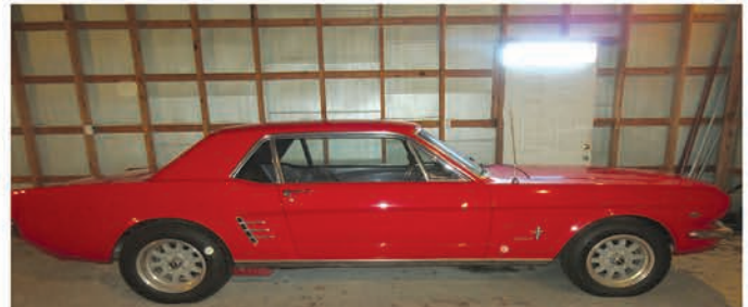
1966 FORD MUSTANG 2 DOOR HARD TOP COUPE V8 Motor Restored (excellent condition)

Lift Chair w/ Massage & Heat (like new) • Lift Chair • Stand Lamp • Hurricane Lamps • Coffee Table • Sofa • Misc Wall Decor • TV Stand • Wooden Bar Stools • Stand Fan • Picture Frames • Assorted Rugs • Luggage • Hall Tree • End Tables • Tea Cart • Crystal • 55" Vizio Television • Assorted Glassware • Whirlpool Washer • Amana Dryer • Toaster Oven • Small Kitchen Appliances • Shark Vac Cleaner • GE XL Refrigerator • Portable Heaters • Sentry Safe • Filing Cabinets • Sewing Machine • Wooden Book Shelves • Wooden Office Desk • Electric Heaters • Linens • Clothes Rack • Keurig • Cookie Jars • Pots & Pans • Cutlery • Bakers Rack • Pyrex • Wooden Table w/4 Upholstered Chairs • Lowry Piano • Office Chairs • Rocker Recliner • Office Desks • Wooden Rocking Chairs • Plant Stands • Office Equipment • 4pc Wood Bedroom Suite • Quilts • Night Stand • Oak Standing Mirror • 32" Panasonic Flatscreen TV • Eden Pure Heater • Wicker Dresser • Figurines • Fire Place Screen • Other